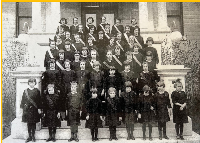
1923 - 1924 In Front of 1913 Addition. It Still Exists Today.