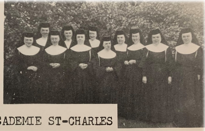
PERSONNEL DE L'ACADEMIE ST-CHARLES

SAINT CHARLES PARISH - PAROISSE DE SAINT-CHARLES