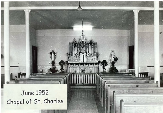
June 1952 Chapel of St. Charles