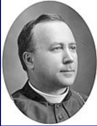
Archbishop Langevin

"All four of our children have attended St. Charles Catholic School from Kindergarten onwards. Our family's faith community, religious education and experiences, and relationships with God have come through the community of St. Charles. We consider ourselves fortunate to have chosen this path through St. Charles for our family and I believe these experiences will have created a solid foundation for the children's faith development for year's to come.