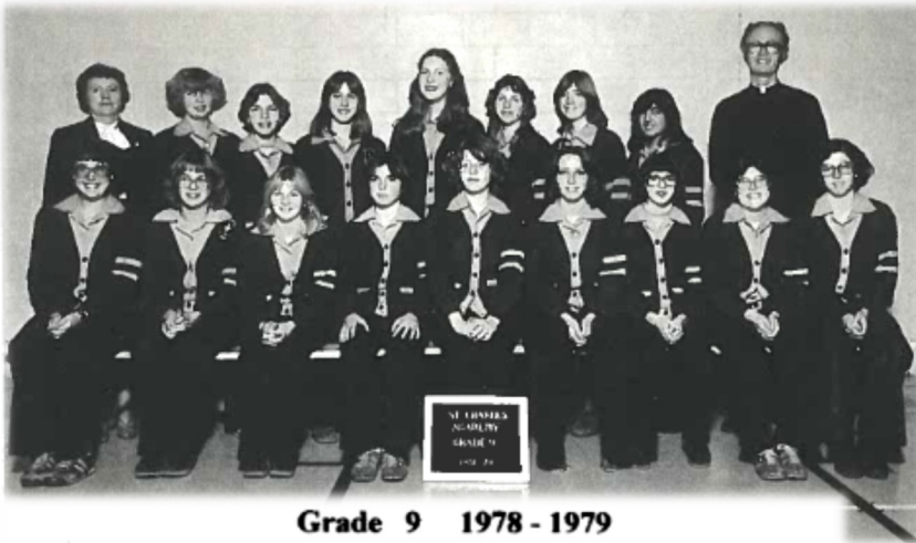
Grade 9 1978 - 1979