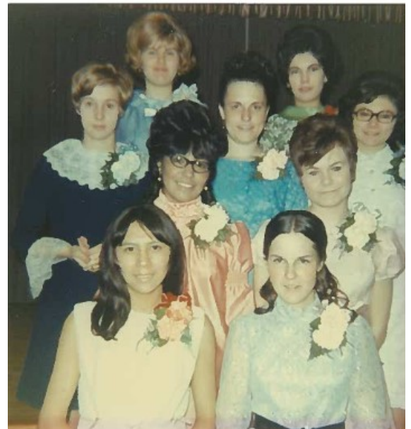
Grade 12 1968 - 1969