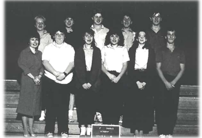
Grade 9 1988 - 1989