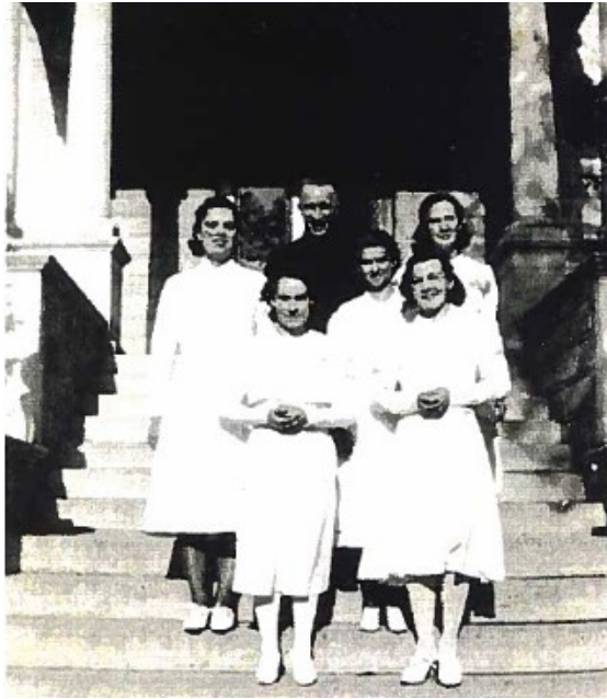
Grade 12 1938-1939