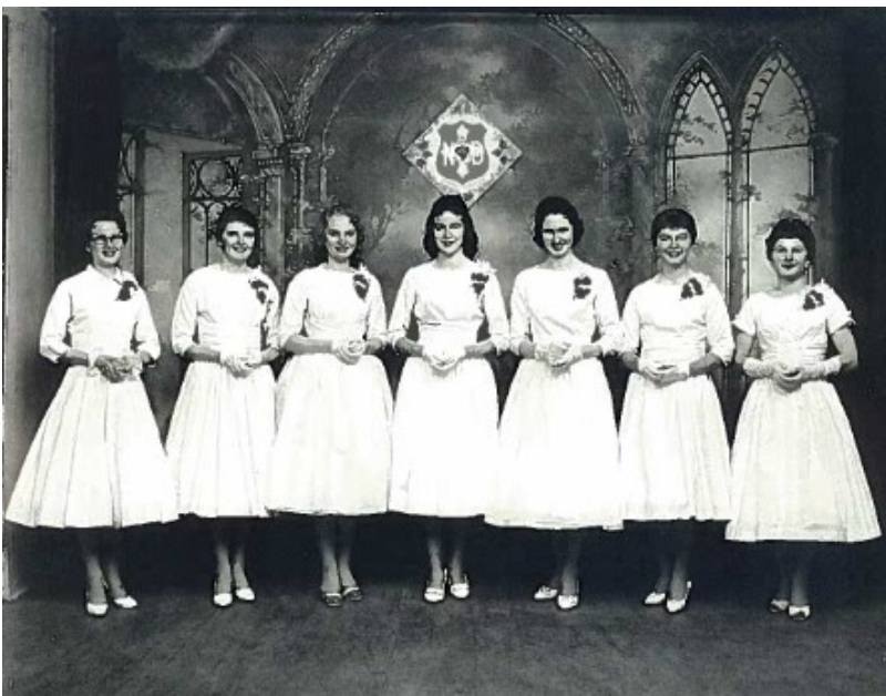
Grade 12 1958 - 1959