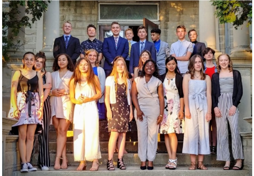
2018-2019 Grade 8 Class - Best wishes in your new schools

Over the years at St. Charles Convent, Academy and finally St. Charles Catholic School, there have been many milestones that have all served in the role of defining the overall mission of Catholic formation of youth in west Winnipeg and beyond. From its origins as St. Charles Convent on September 10, 1906 when the Missionary Oblate Sisters opened its doors to 41 students, to 1962, when the name changed to St. Charles Academy with the addition of a library, swimming pool and science laboratory, to the year 2000, when the school became known legally as St. Charles Interparochial School and commonly known as St. Charles Catholic School, the common factor that has been present throughout the years has been the students who came to St. Charles for a Catholic education. More than 7000 students have passed through these doors over the years, each one with their own cherished memories of what St. Charles has meant to them. May we always take the time to remember and reflect on the unique role that St. Charles has played in the community of west Winnipeg, and in our lives ....and to be thankful that we were fortunate enough to be a part of this amazing school community.