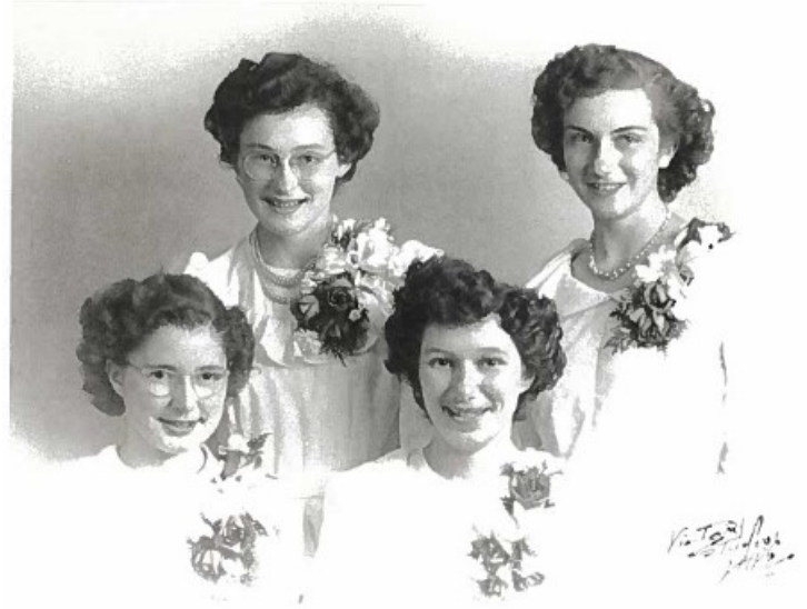
Grade 12 1948 - 1949