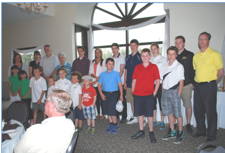
Golfers, from novice to pro, Alumni and current students, enjoyed a wonderful day of golf, fun and camaraderie all for a great cause.

Thank you to everyone that helped make this another successful fundraiser for SCCS and save the date for next year... Monday, May 26, 2014 at Breezy Bend. Hope to see you there!