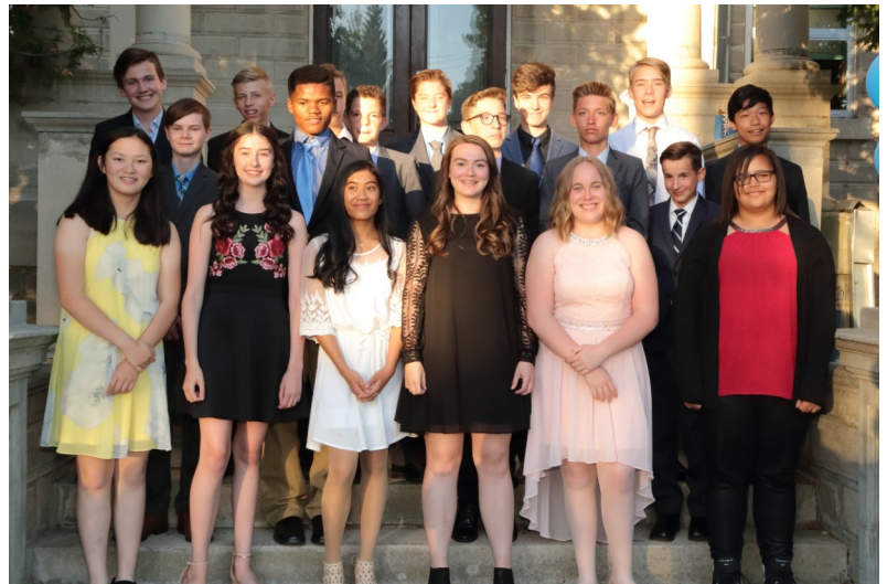
2017-2018 Grade 8 Class - Best wishes in your new schools

Over the years at St. Charles Convent, Academy and finally St. Charles Catholic School, there have been many milestones that have all served in the role of defining the overall mission of Catholic formation of youth in west Winnipeg and beyond. From its origins as St. Charles Convent on September 10, 1906 when the Missionary Oblate Sisters opened its doors to 41 students, to 1962, when the name changed to St. Charles Academy with the addition of a library, swimming pool and science laboratory, to the year 2000, when the school became known legally as St. Charles Interparochial School and commonly known as St. Charles Catholic School, the common factor that has been present throughout the years has been the students who came to St. Charles for a Catholic education. More than 7000 students have passed through these doors over the years, each one with their own cherished memories of what St. Charles has meant to them. May we always take the time to remember and reflect on the unique role that St. Charles has played in the community of west Winnipeg, and in our lives ....and to be thankful that we were fortunate enough to be a part of this amazing school community.